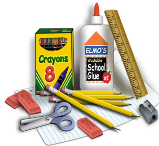
Some school supplies given out