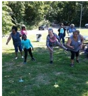
Participants playing horseshoe

We introduced some of our projects to those in attendance and got many involved in the collection of can tabs for the Ronald McDonald House.