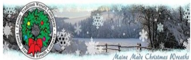
Family Tradition Wreath Company

The New Vision Pioneers Marketplace is kicking off our Holiday Fundraising season with the popular "Maine Balsam Wreath Fundraiser" with Family Tradition Wreath Company, located in Cutler, ME. or choose 100% American Made RADA cutlery for a great holiday gift for that special person or Flower Petal for flowers and gifts.